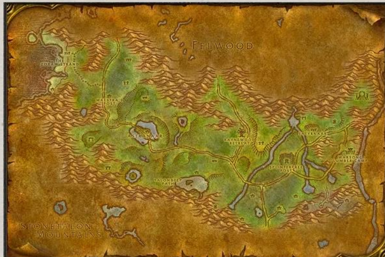
Map of Ashenvale Targets

The first objective was apparently led by a false rumor that alliance forces were due to split off the main group after the rally, the bulk