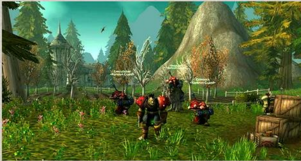
Kor'Kron Guard on Patrol