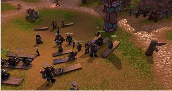
Giving Thanks to the Earth Mother - Shattered Company