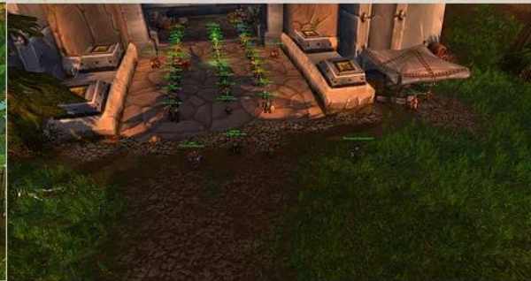
Clan Hammersong Formation courtesy