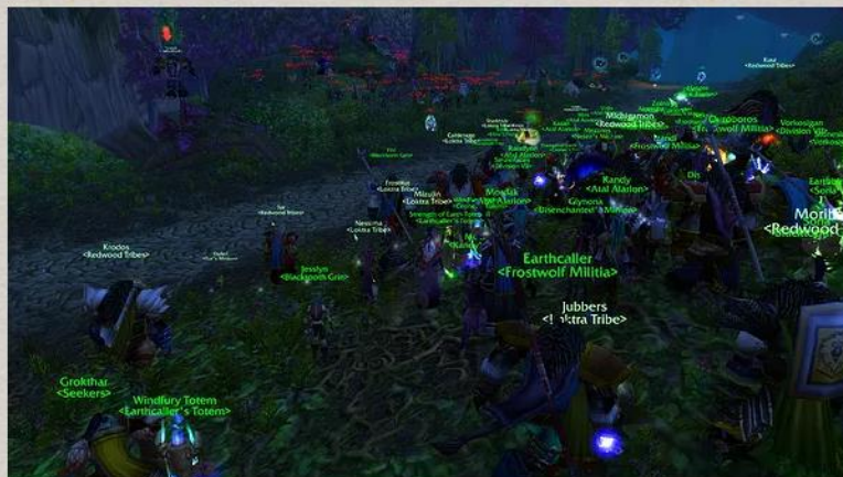
Pictured Above: Forces Gathering Beneath Raynewood Retreat

Five armies met five armies and much chaos ensued. Seeking revenge for the attack on the Barrens, several Horde tribes and clans answered the call to invade Astranaar. Seeking a return to an easy target, Horde leaders moved to Raynewood Retreat, and saw a sizable Alliance army gathered before them. Testing and taunting ensued to see who would break ranks, but officers on both sides were able to keep flared tempers in check as the Alliance moved back into the forests of Raynewood.