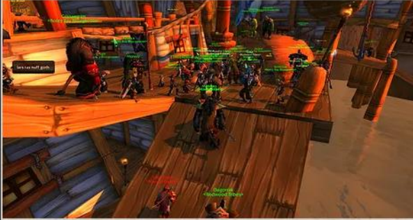
Pirate Day Hosts Booty Bay Bourgeoisie