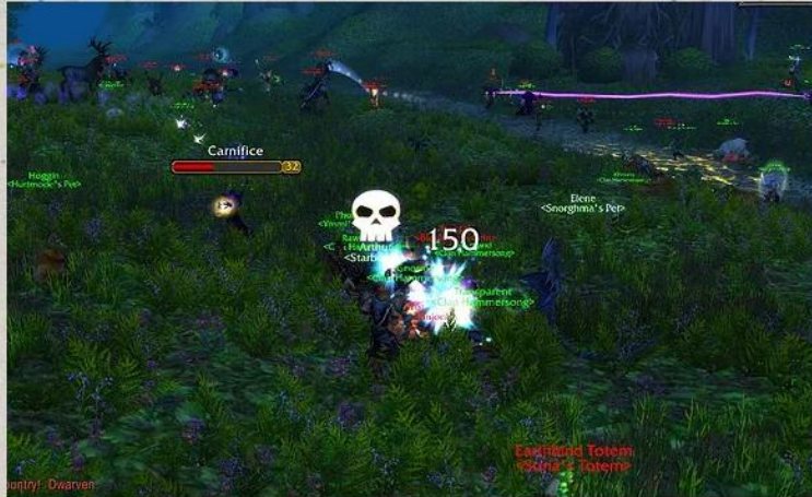
Pictured Right: Raynewood Defense on Road to Felwood

Routed, the Horde retreated to the bridge over the river Falfarren River. The Alliance clashed again, a force twice the size of the beleaguered Horde, who retreated again towards Splintertree Post. While marching onward, the Alliance soldiers were joined by Clan Battlehammer, forty strong, and together they launched an attack on the Horde outpost.