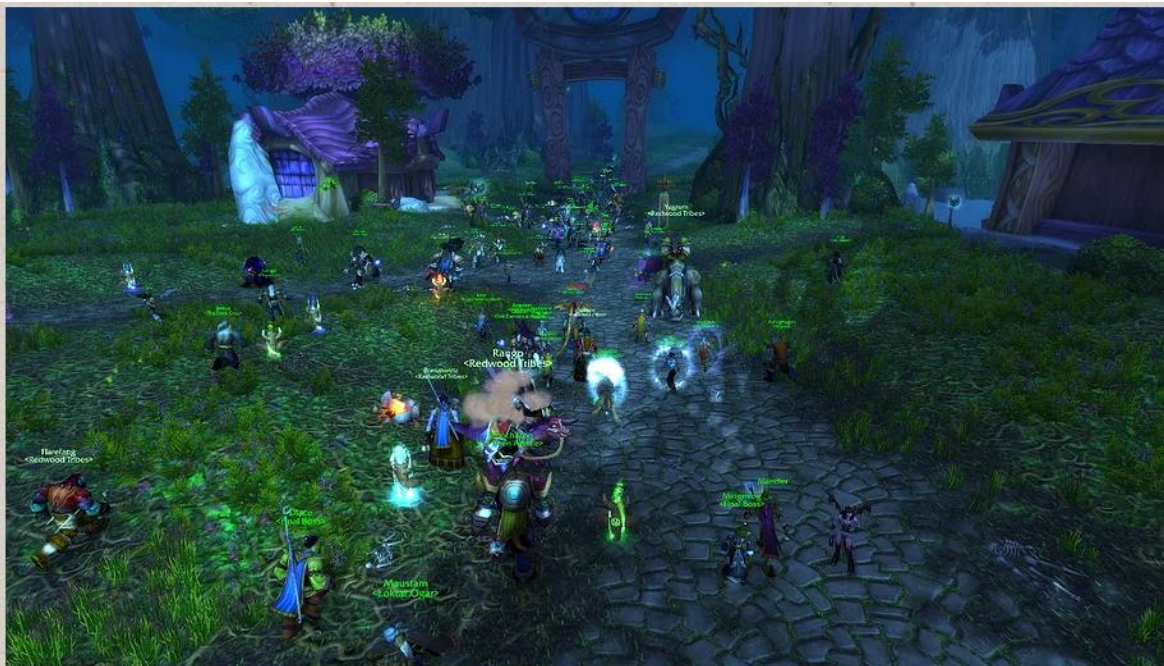
Above: Redwood Troops await Alliance at Warsong Camp Below: Astranaar relieved of numerous supplies to be distributed to Horde citizens in need

Answering the need for blood, the Tribes marched swiftly to Astranaar, not only after the rally, but after another Horde strike force met with Alliance on the roads of Ashenvale. The Tribes spared countless lives of children and innocents, retrieving food stores to be used in the Horde war effort.