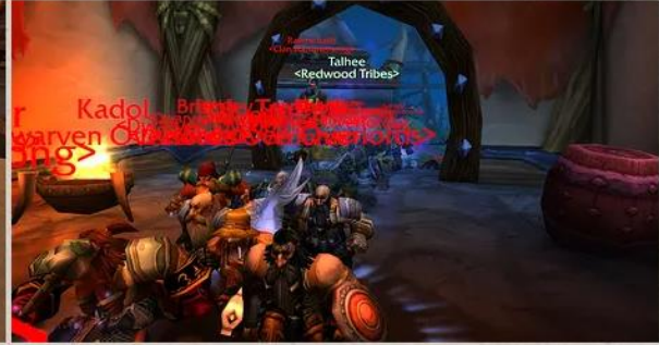
Clan Hammersong New Initiates Overrun Splintertree Post