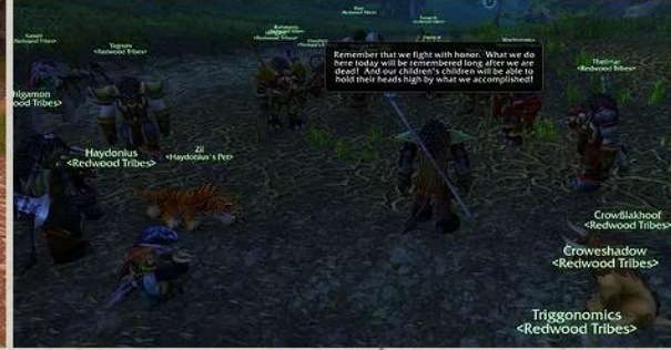
Redwood: Remember that we Fight with Honor...