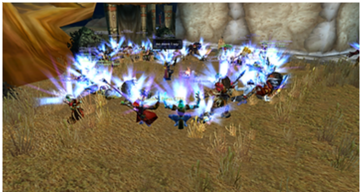
Lewid Proclaims Tribe First! picture by Gin'jojo