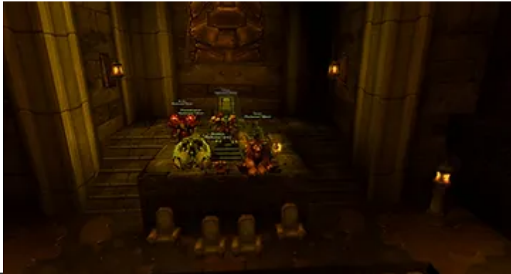
Kaylan and the Sage speak in the calm of the Barrens