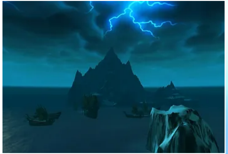
Maragwyn shares some cold beauty