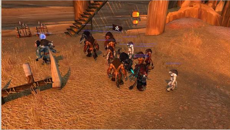
Pictured Above: Gathering at the Great Gate

These fine looking Shu'halo are about to run a race for their very lives! Who will Survive?