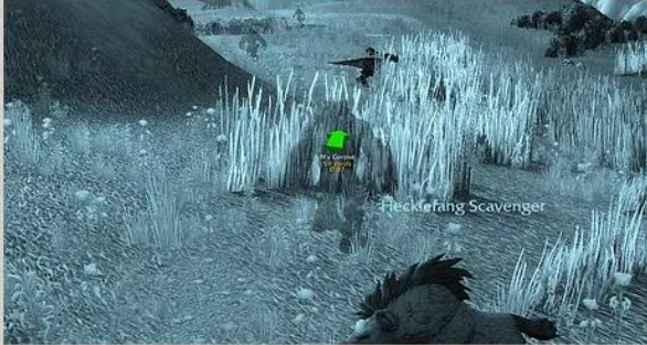
The Scavenger Can Not Kill What is Already Dead

"Finally, we stood on a bridge, Crossroads and solace in sight across the wide gorge, our guide turned us towards Stonetalon Mountains, instead of what some muttered was a safer route along the coast to Ratchet. What could we do, but stick together... And then the word to run to Malaka'jin; some of us had never heard of it. Why oh why, didn't I follow the two that ran up the hill? Instead there were Alliance soldiers raining bullets and swinging swords as we rushed through their outpost at the border of Stonetalon and Ashenvale.