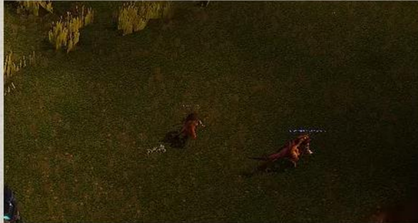
A Raptor Kills One, but One Escapes

"And spiders... so many, then to Ashenvale and Bears!!! When will the madness stop? At what point do we sacrifice our fellow Shu'halo to the predators so that we can survive?"