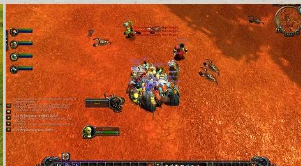
Orcs killing Sarkoth the Scorpion - or group hug

The pictures above are just one example of what one might see should they travel back in time to an alternate reality.