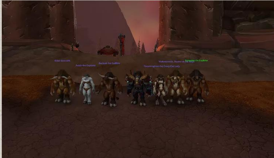
- The Survivors of Naked & Afraid: Tauren Edition hosted by Wook'ee Eagle-Eye

"And when I crossed into the Valley of Strength, a shadow crossed over me, and I looked up to see the slow Zeppelin from Thunder Bluff approaching the Orgrimmar tower... never again, I pledged, never again!"