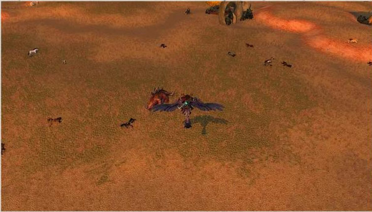
Pictured Left: Mangled Bodies in Southern Barrens

Yet, through the Spirit Healer's blessing, we rose up to find our corpses and to run again. A Terrortooth Scytheclaw charged and claimed one victim, a shrill cry as an Outgrowth claimed another, and then the Hecklefang Scavenger... it tore into one, but not satisfied it killed five more, until none were left standing. Ghosts, we ran back again.