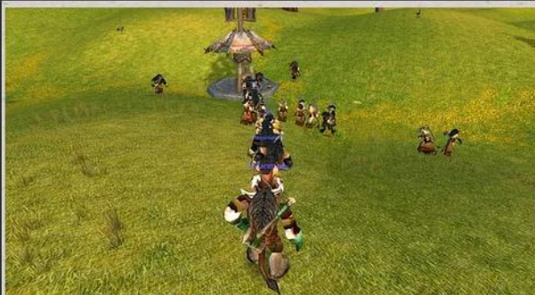
Shu'halo retrieving a pitcher