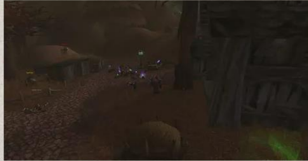
The Town of Terrordale under current normal conditions

No communications had been heard for some time and a Druid of the Cenarion Circle had ventured there to make contact, only to be silent himself.