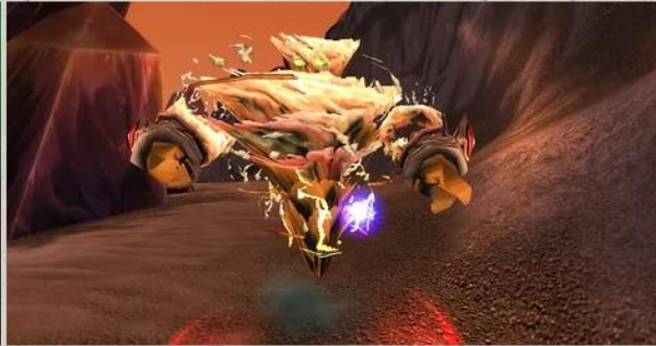
He Look Angry - He Probably Is Angry