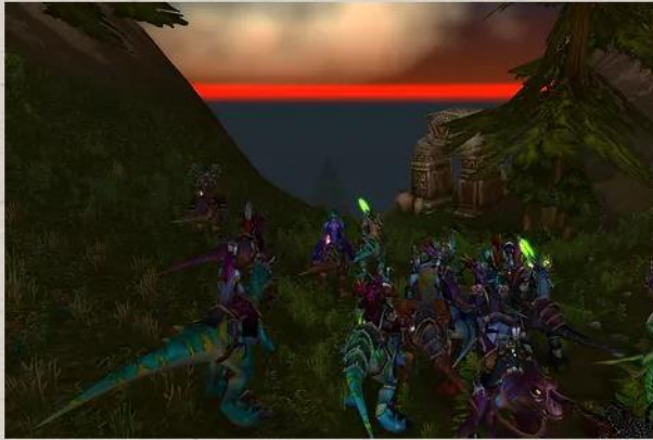
The Trolls Gather