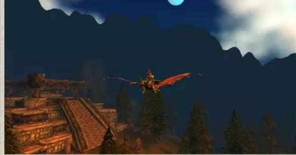
Pogo on a Scouting Mission