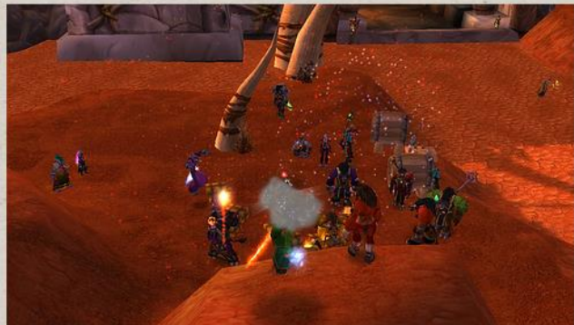
Opening Blessings Ayashe, Garrox (BP), Stan.

The heat from the fireworks was only matched by the strength of bonds that have been forged over time by members of the Horde!