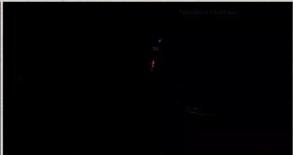
And then it got darker