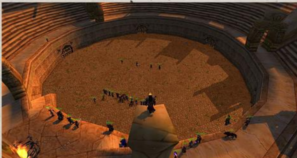
Smooky watching from above us

There is a reason they yell "Fear the Grin!"