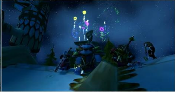
Branharak's Viewing Party