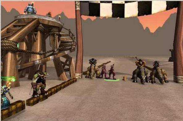
Sauromoon seeks to prove how fast he can be!

Kragoth is brilliant! What is better than testing your trusted ally and companion against those of your Tribe and your Allies? Winning gold for the effort to help in offsetting the cost of war, helped, as well, but for some of us it was nice cone of Tigule and Foror's Strawberry Ice Cream! For some, it was the first time they had had ice cream, such as the two peons that also raced around the track on foot.