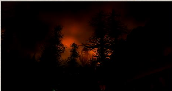
Ghostly Image