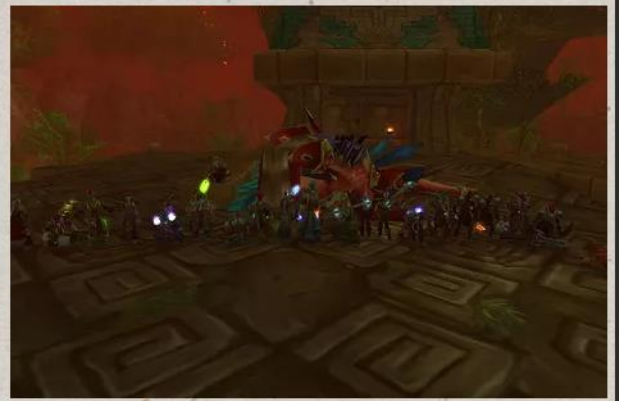
Victory picture by Gin'jojo