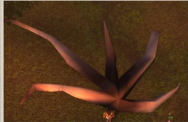
The Chieftain finds an interesting part of a dragon's wing.