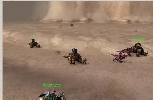
Racing down the stretch!