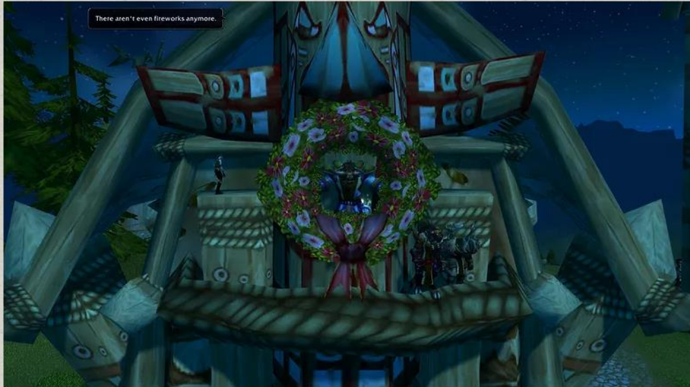
Friends Find Strange Places Together