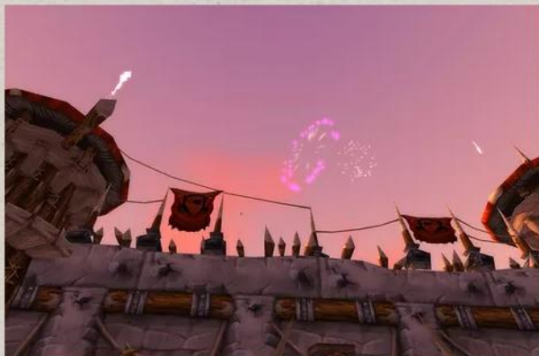
The Horde Celebrates