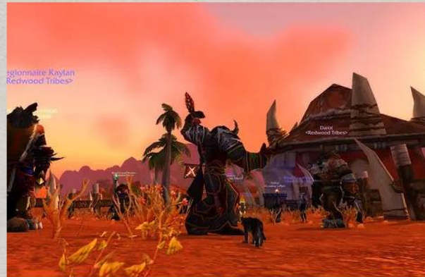
The Winner's Pose by Kragoth