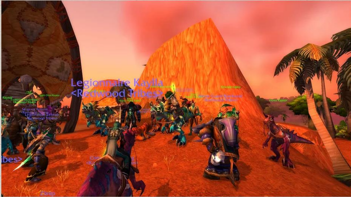
Friends gather as wholesome and caring Bown'go gets an extremely speedy Raptor

In other news, while looking for clues in Sen'jin Village, Guardian Bown'go found a new friend that is not a dragon!