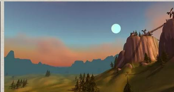
Tanchou Appreciates the Beauty of Mulgore