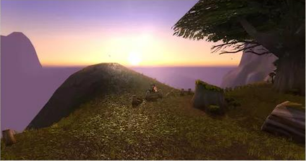
Ayashe Contemplates the Fools that Jumped