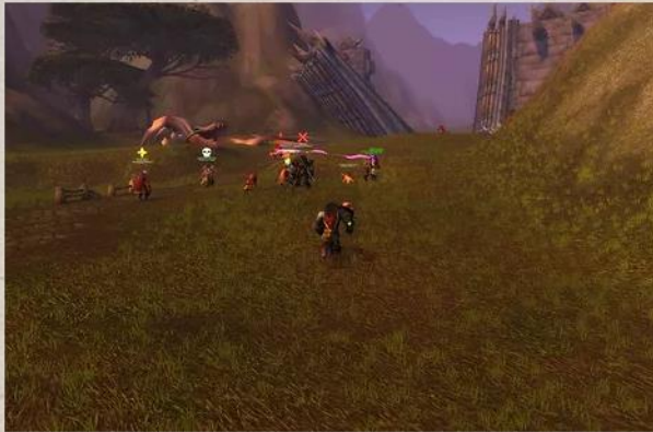
Here there be draons

Many were injured in the attempt to bring home the recalcitrant Troll and Troublemaker.