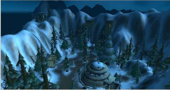
Kaylla is Visiting Dwarves?