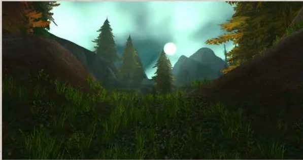
An'she Rises over the Eastern Kingdoms