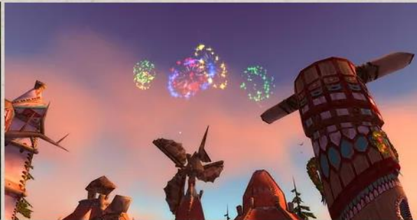
Fireworks are best over Thunder Bluff