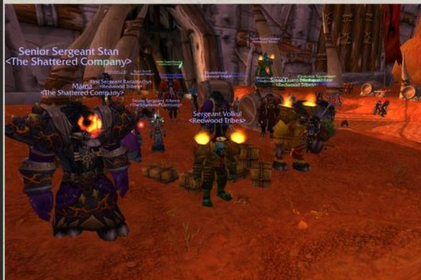
Look who is having fun!