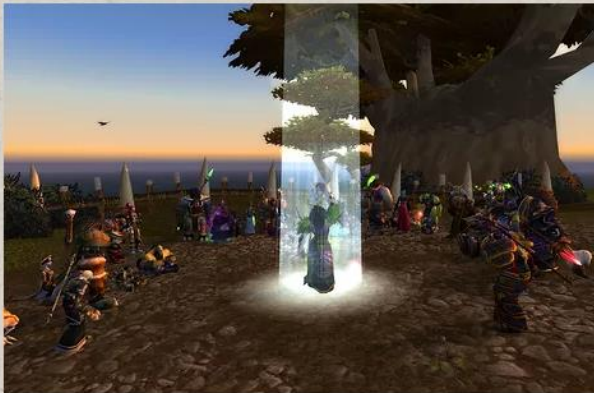
Traditional Blessings.

The Shattered Company brought us together to share in a celebration as some of their members were accorded special honors. There was racing, food, spirits, and as always great companionship. Congratulations to those that were honored. You do your Company proud!