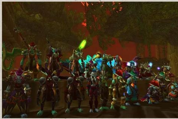
Mighty Trolls picture by Saz'kil