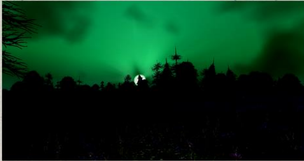
Forsaken Moon by BP